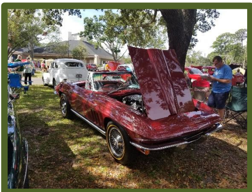
BEST OF SHOW, 1965 CORVETTE CONVERTIBLE